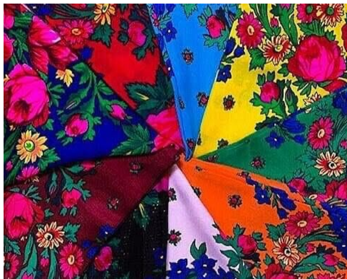
Ukrainian scarves worn by Ukrainian women and Métis